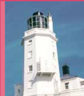
St Anthony Lighthouse