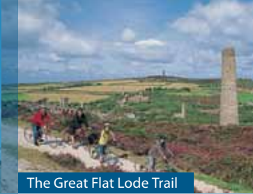
The Great Flat Lode Trail