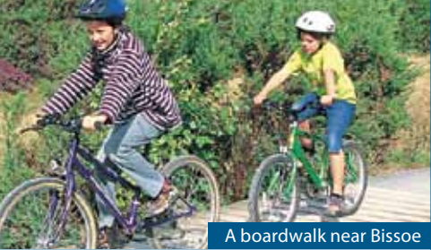
A boardwalk near Bissoe